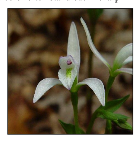
(usually 3) leaves. The lip of the flower has three bright green crests.

Small, ovate, clasping leaves are scattered along a fragile purple stem and one white to pale pink, nodding flower rises from each axil of uppermost 1-6