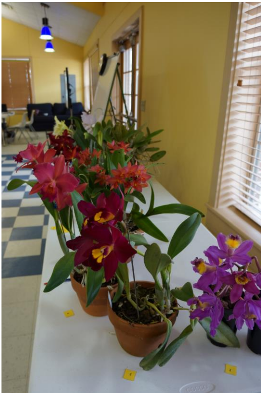
Show and Tell Tables for March 2018