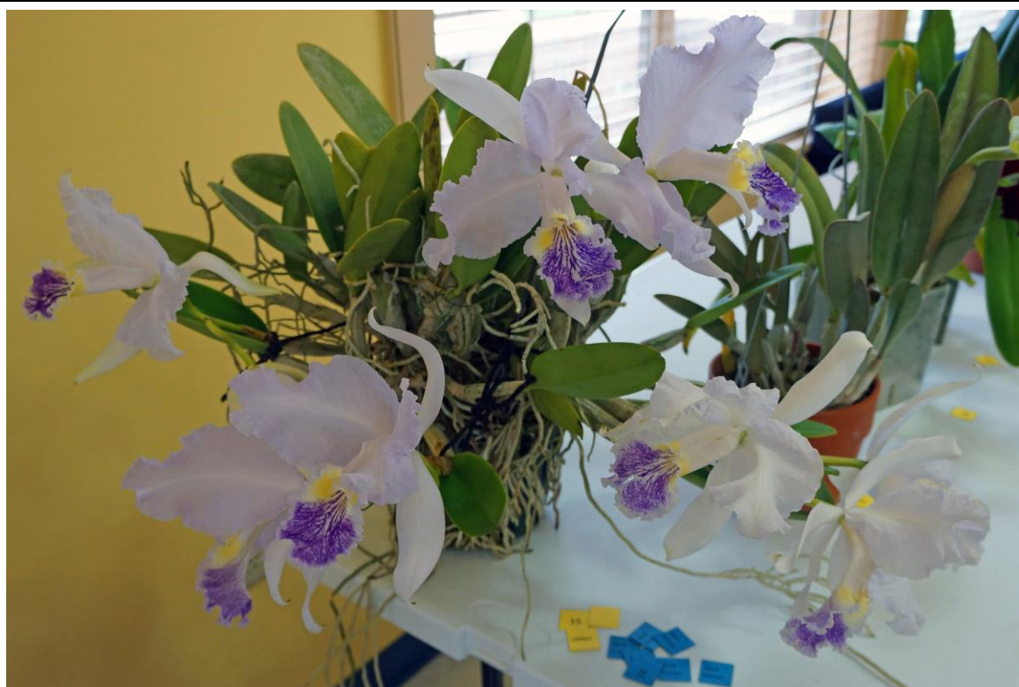
Best Grown Cattelya lueddemanniana var. coerulea Eron Borne