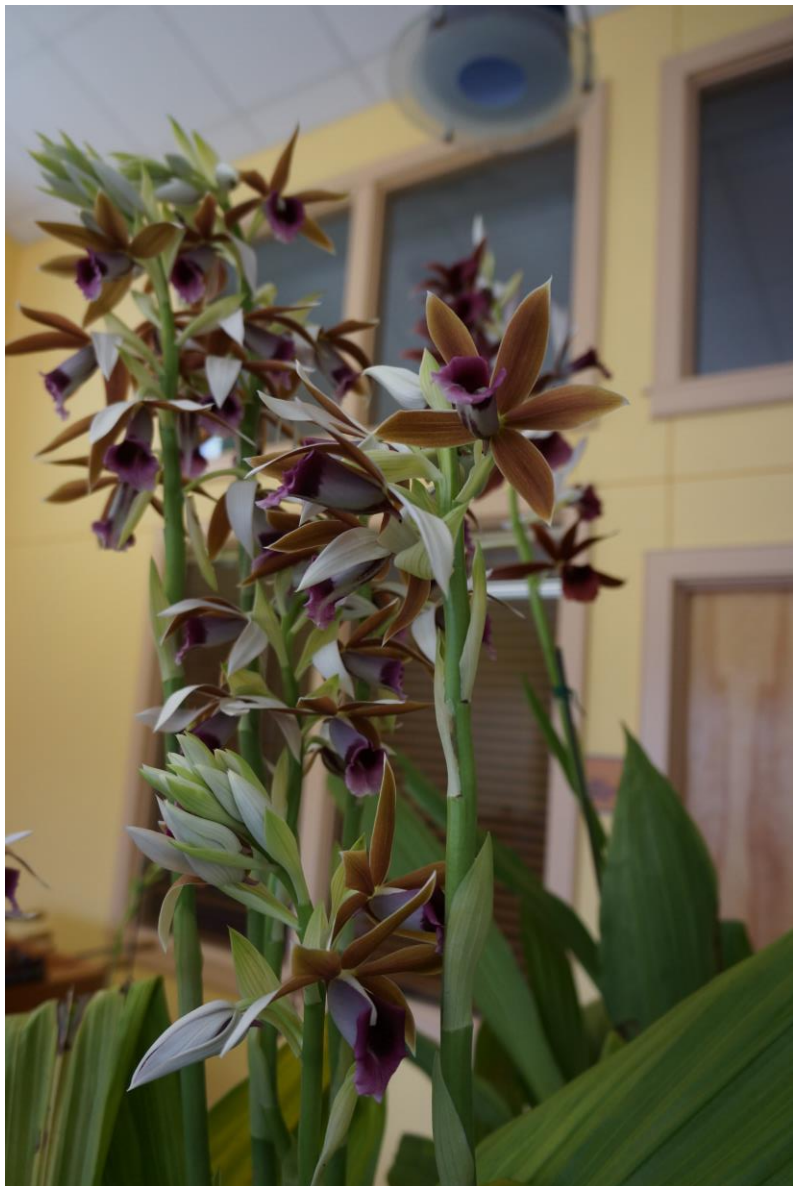
Tied for 1 st place Phaius Tankervillea Wilton Guillory