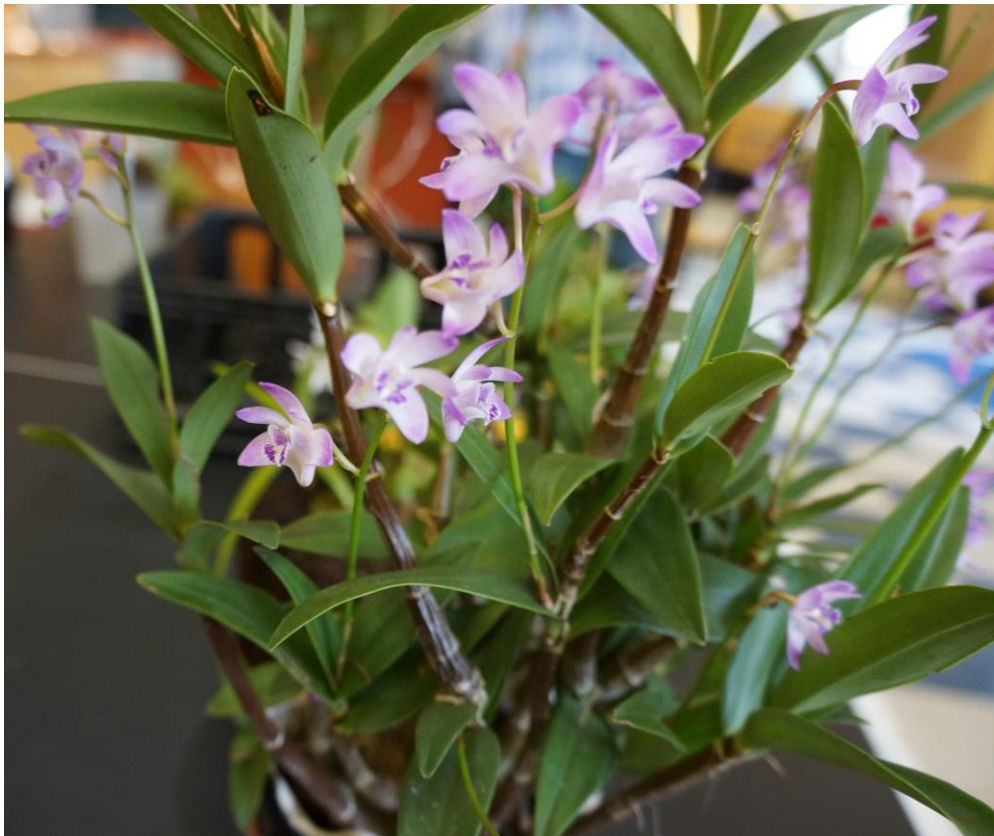
Dendrobium Rick Allardyce 3 rd place