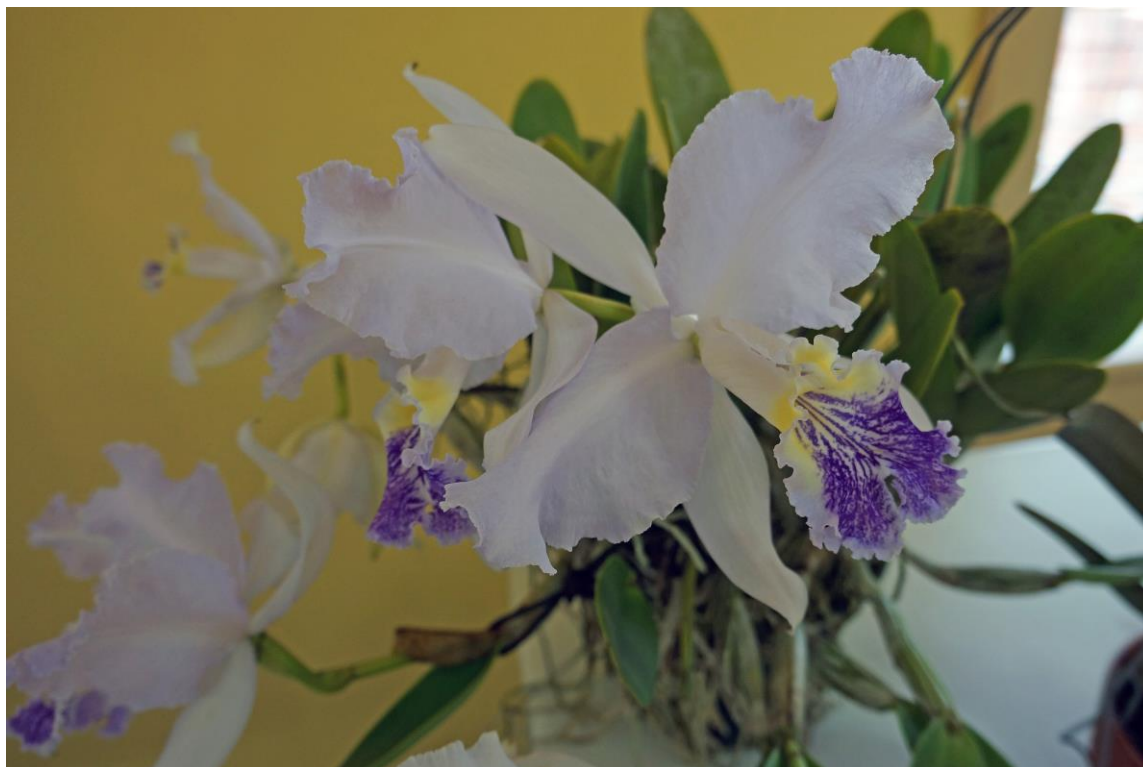
Best Grown Cattelya lueddemanniana var. coerulea Eron Borne