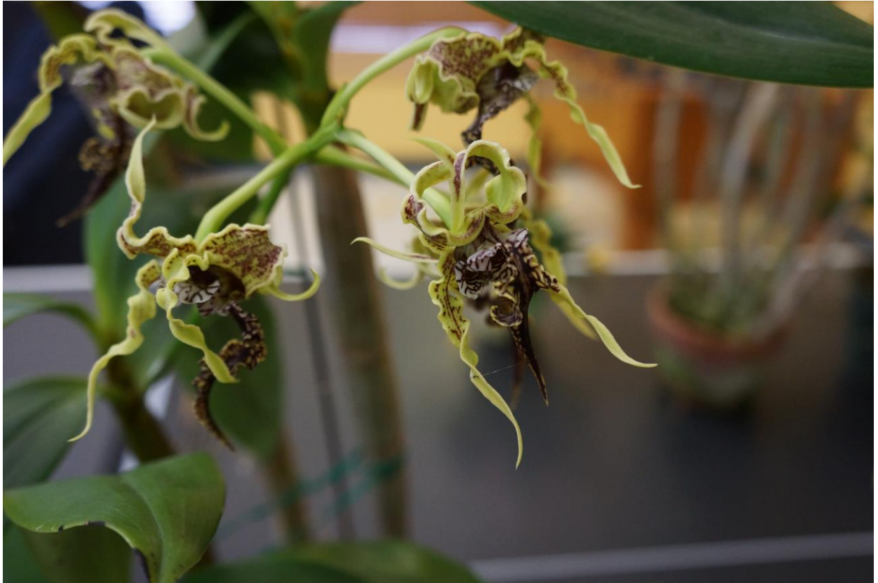
Den spectabile placed 1 st in Others Div- Al Taylor