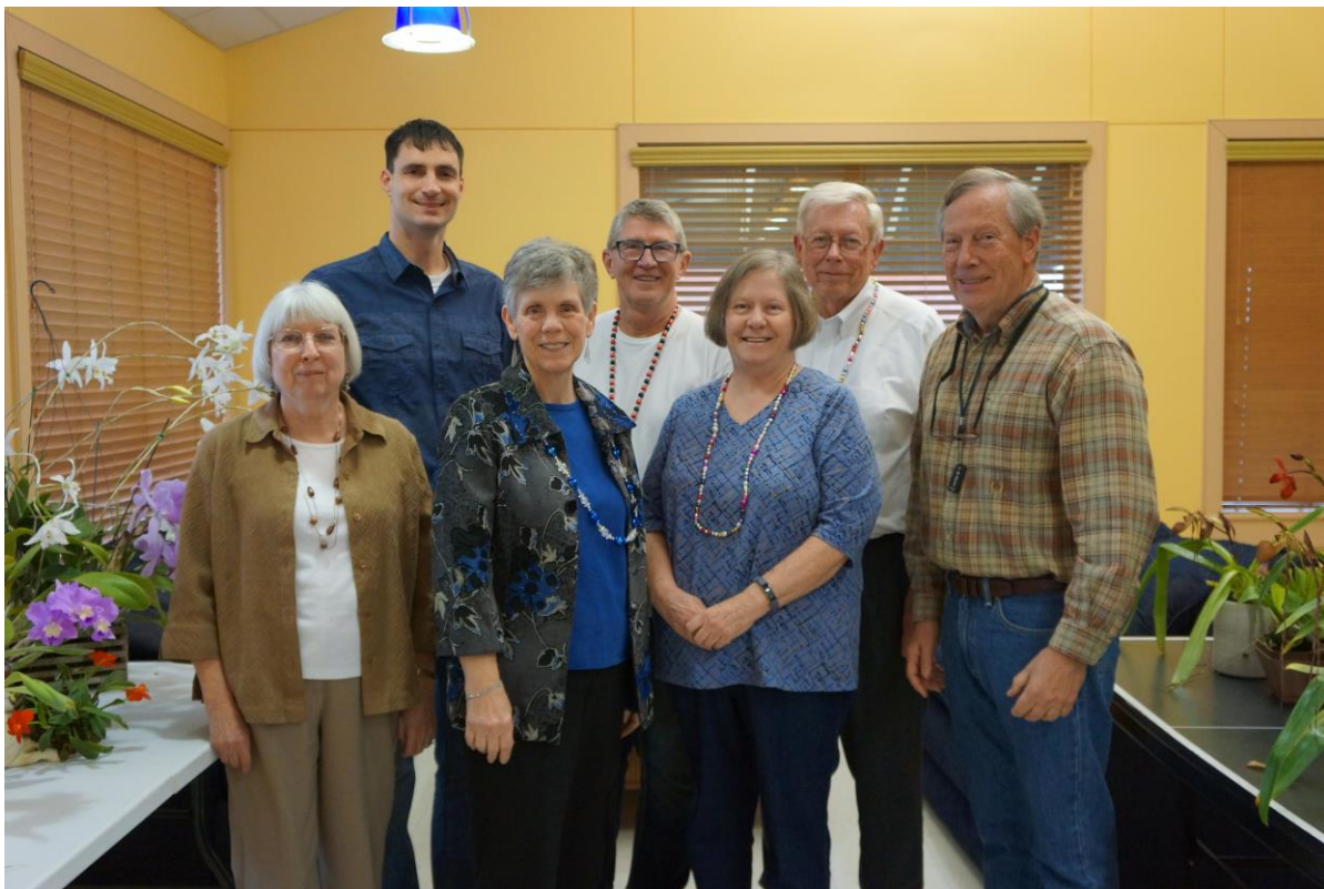
2018 CLOS Officers