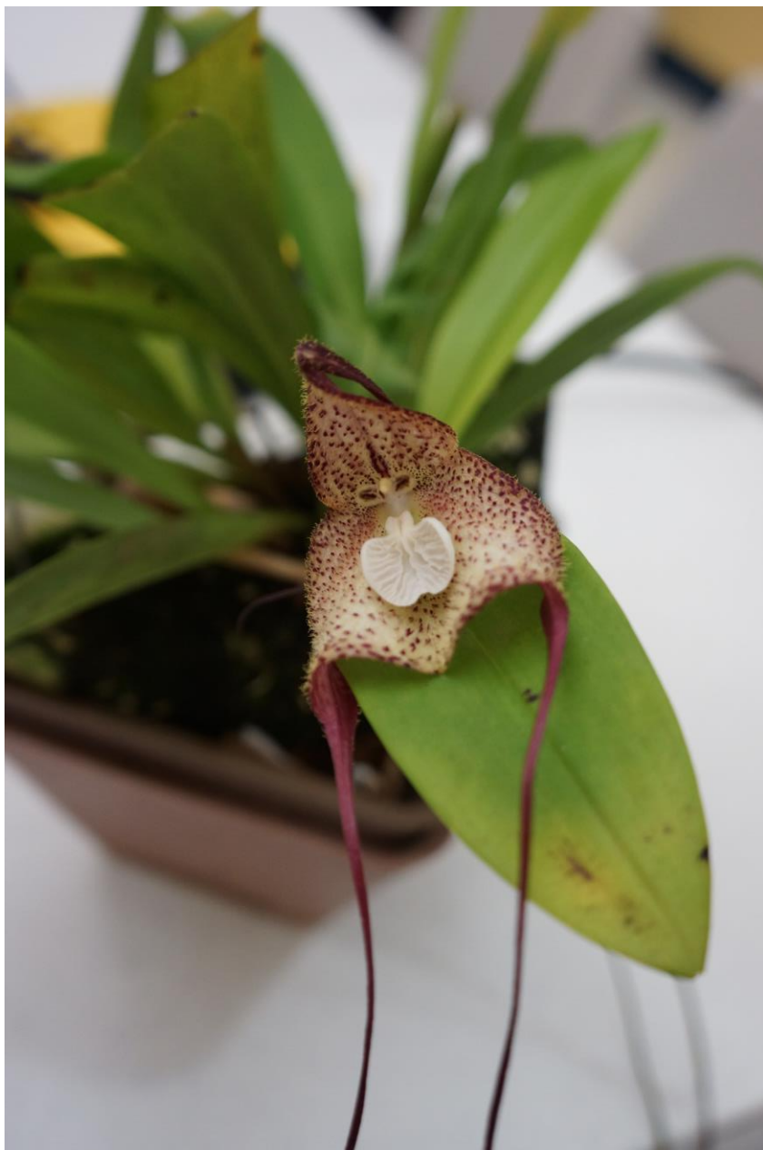
Dracula 'Swamp Fox' - placed 2 nd in Other Div-Julia Borne