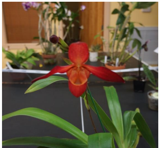
Phrag. Red Baron place 2 nd in Cyps Div.-Julia