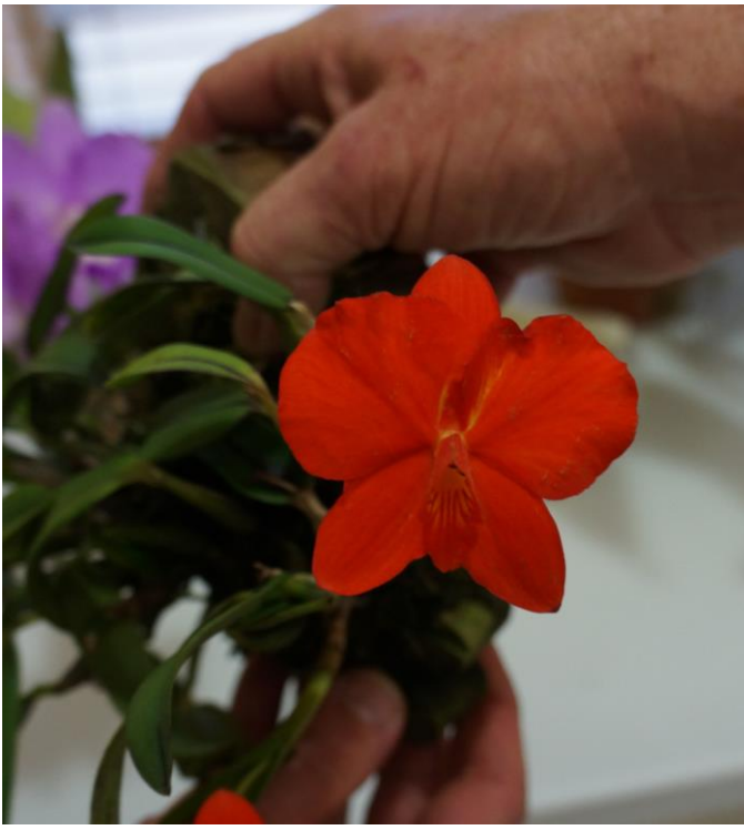
C. coccinea 1 st place Cattleyas-Julia Borne