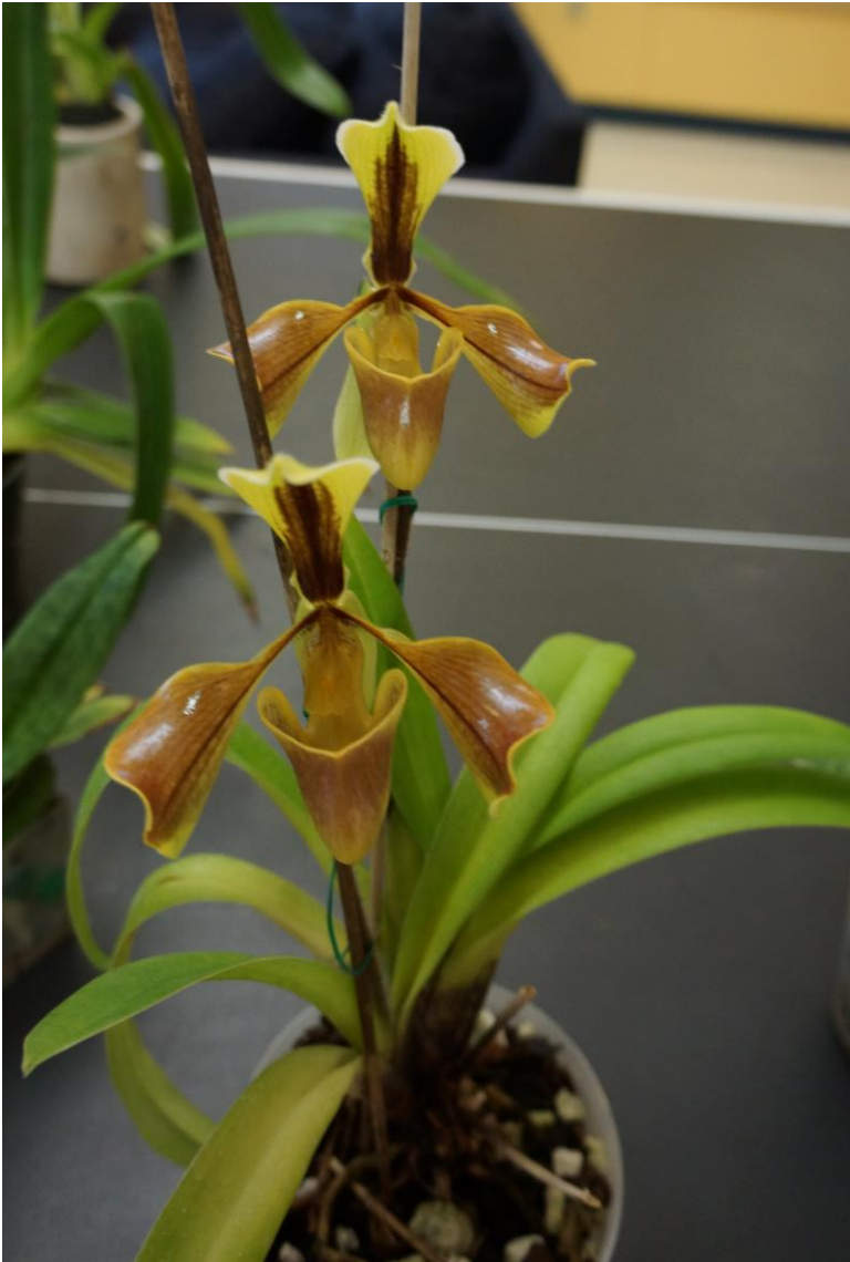
Paph villosum placed 3 rd in Cyps Div-Al Taylor