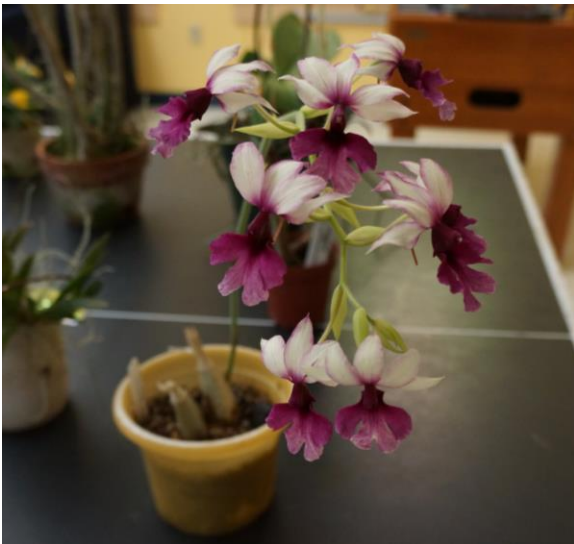
Calanthe hybrid- placed 3 rd in Others-Al Taylor