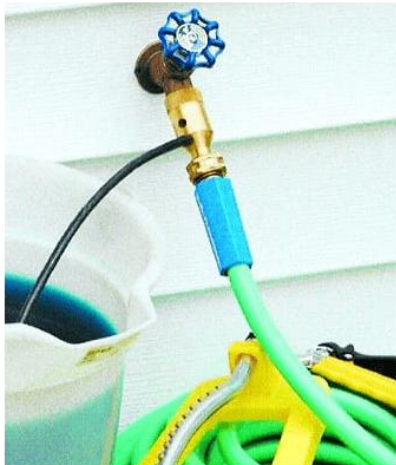
Dramm Syphonject Mixer

Unfortunately, they won't work well with narrow and/or long hoses (unless on the output end), won't work at all with misting heads attached. The most common brand is the Dramm Syphonject: