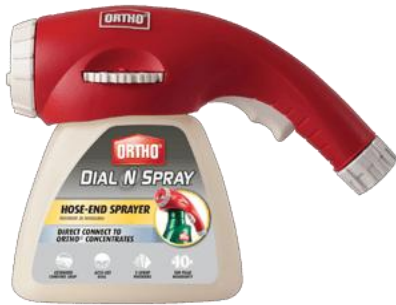
Ortho Dial-and-Spray Hose End Sprayer

in a hand-held device. The Ortho Dial 'n' Spray is my personal recommendation, as it can be adjusted for a wide range of mixing ratios (1 teaspoon-, to 8 ounces-per-gallon) and once you've finished applying the product, you can pour the excess back into its original bottle.