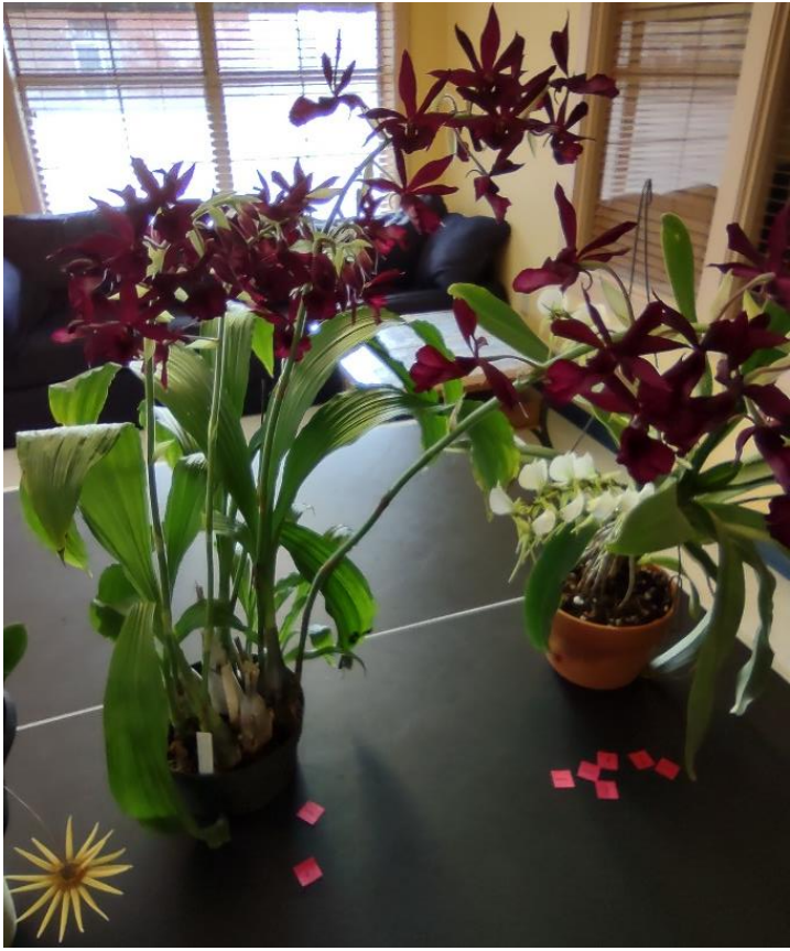
AI's Best Grown Plant – Phcal. Liberty Creek 'Louisiana' HCC/AOS (The color is spectacular!)