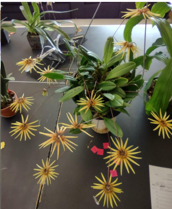
1 st – Angcm eburnum – Al, 2 nd – Bulb. cercanthum – Eron