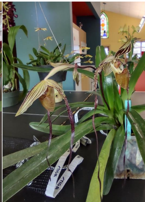
1 st – Phrag. Don Wimber – Eron, 1 st – Paph. venustum – Eron