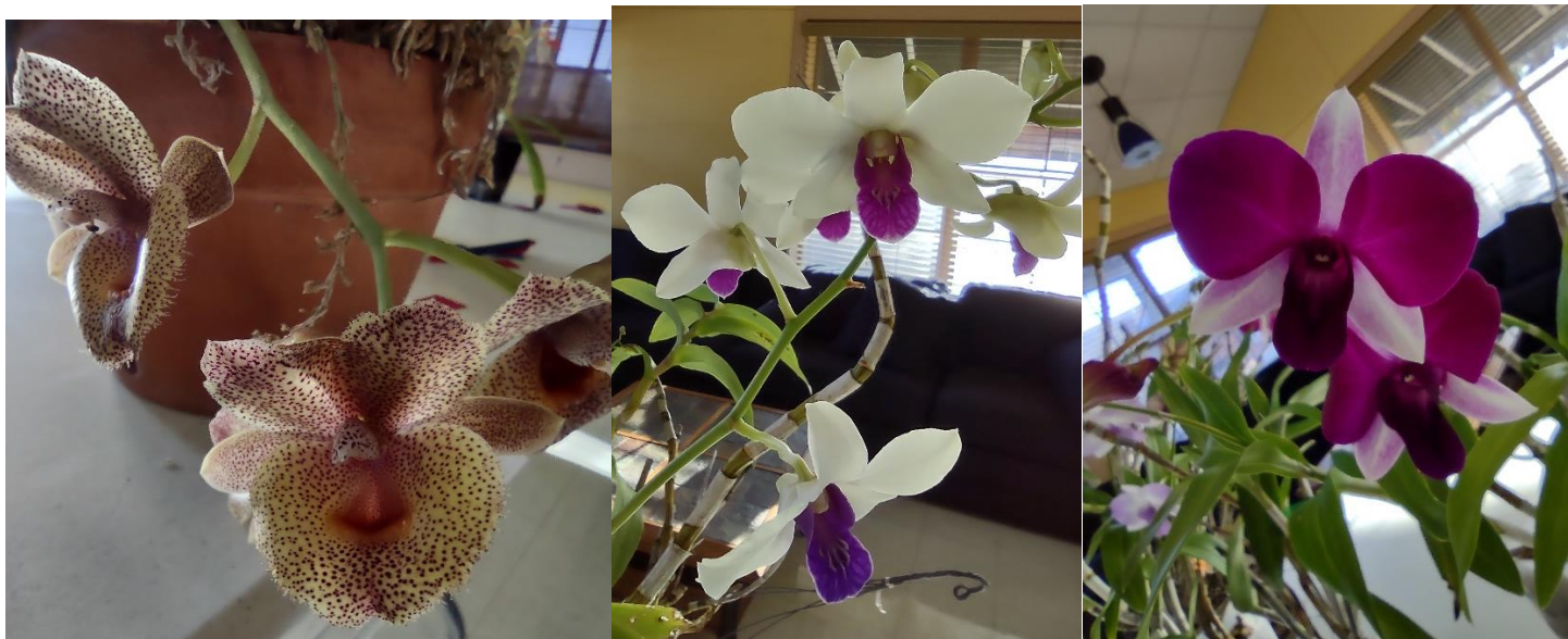
1 st – Catasetum hybrid – Al, 2 nd (tie) – Unnamed Dendrobiums - Andrea