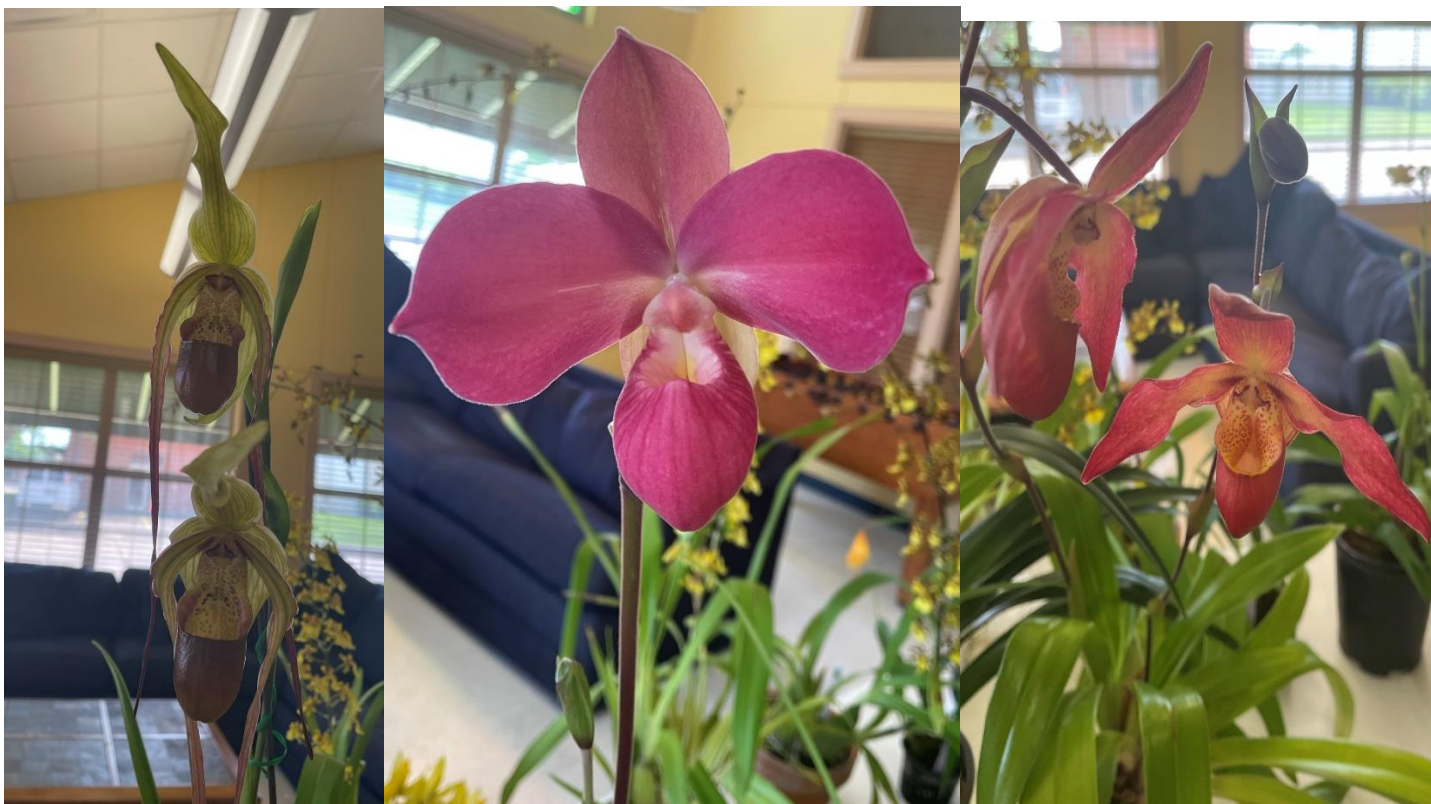
Show & Tell winners - Cypripedium category – Eron(left & center) and Rick(right)