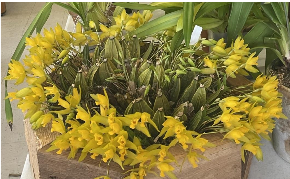
Rick's Best Grown Plant – Lycaste (Yes, it's not supposed to have any leaves as it blooms after dormancy!)