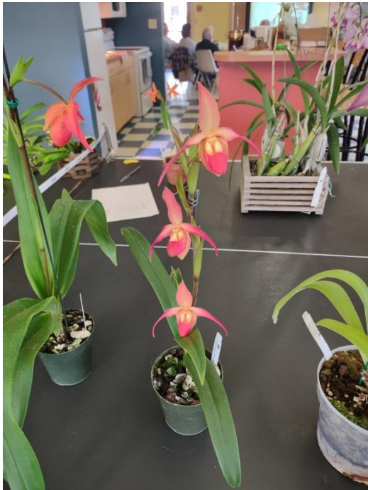
Eron's Best Grown Plant – Phrag. Nicolle Tower