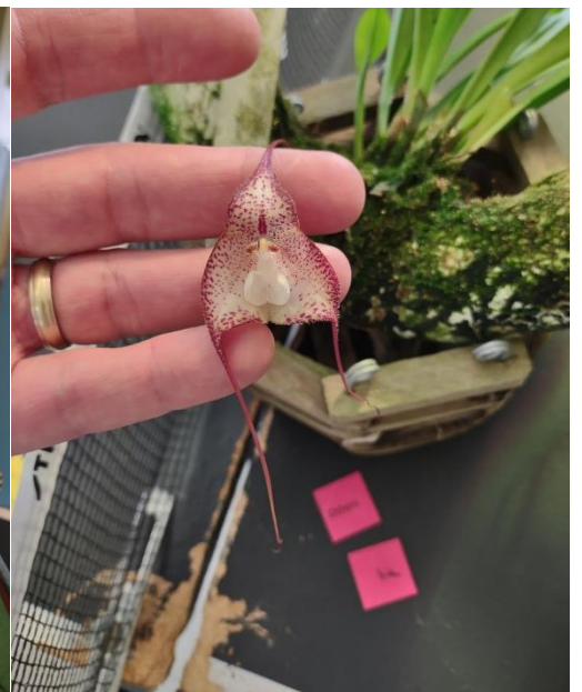
1 st – Phal. unnamed – Heather, 2 nd (tie) – Phal. unnamed – Heather, 2 nd (tie)– Dracula Swamp Fox – Eron