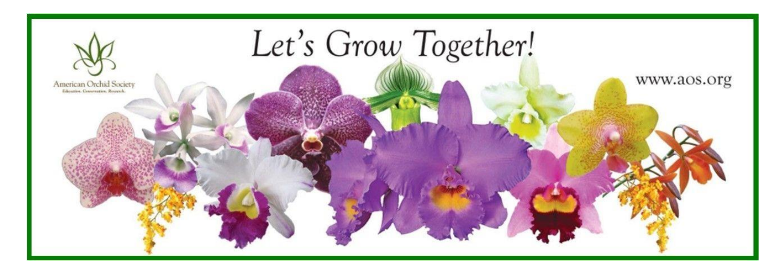
2022 MAY AOS Corner – for Affiliated Societies

We encourage use of the AOS website by all members.