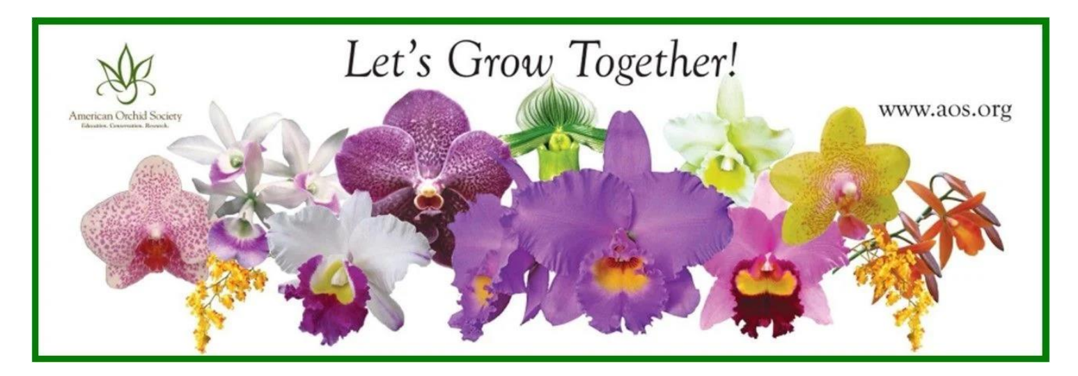
2023 November AOS Corner – for Affiliated Societies

The annual symposium for the Native Orchid Conference will be coming south next April 2024! The conference will be hosted in Nacogdoches, TX, and there will be field trips to a couple of native orchid populations in East Texas and possibly West Central Louisiana. The symposium speakers will be excellent. More information on this event will be relayed as the details are finalized.