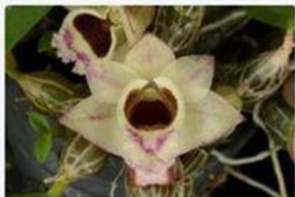
Dendrobium hekouense 'Chandra P'