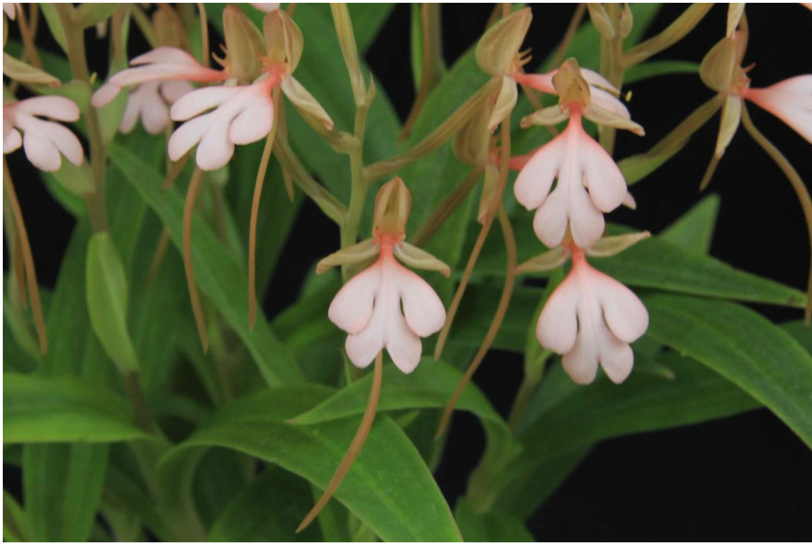
Habeneria rhodocheila 'Louisiana' CCM/AOS 83 pts. Al Taylor's plant. Above and Below