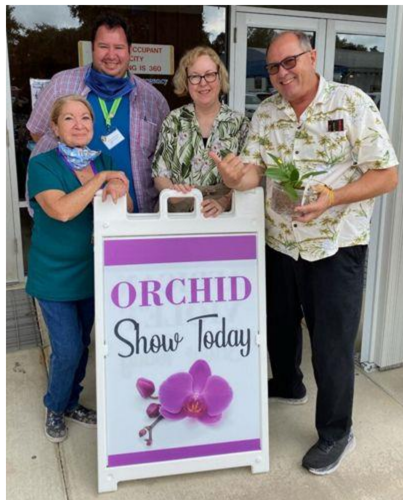
Our Lakeland, Florida affiliate, Ridge Orchid Society, hosted an AOS