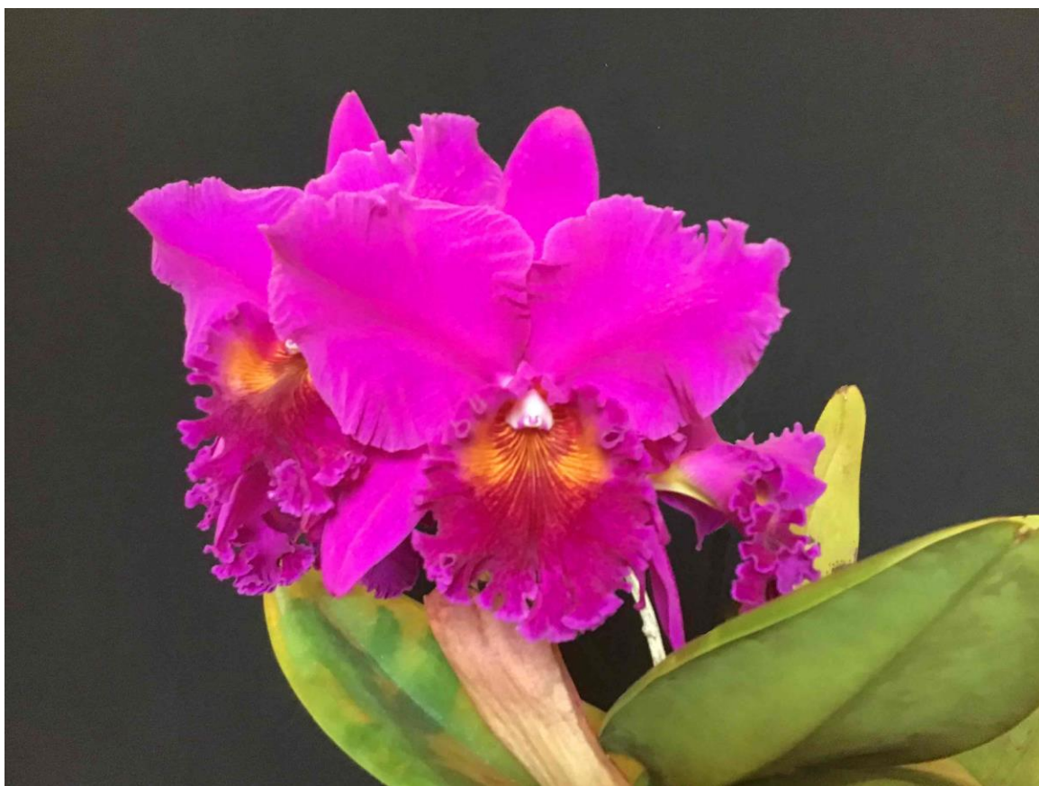
Rlc. Shigeko Abe 'Willistene's Brushstroke' AM/AOS 84 Eron Borne's plant