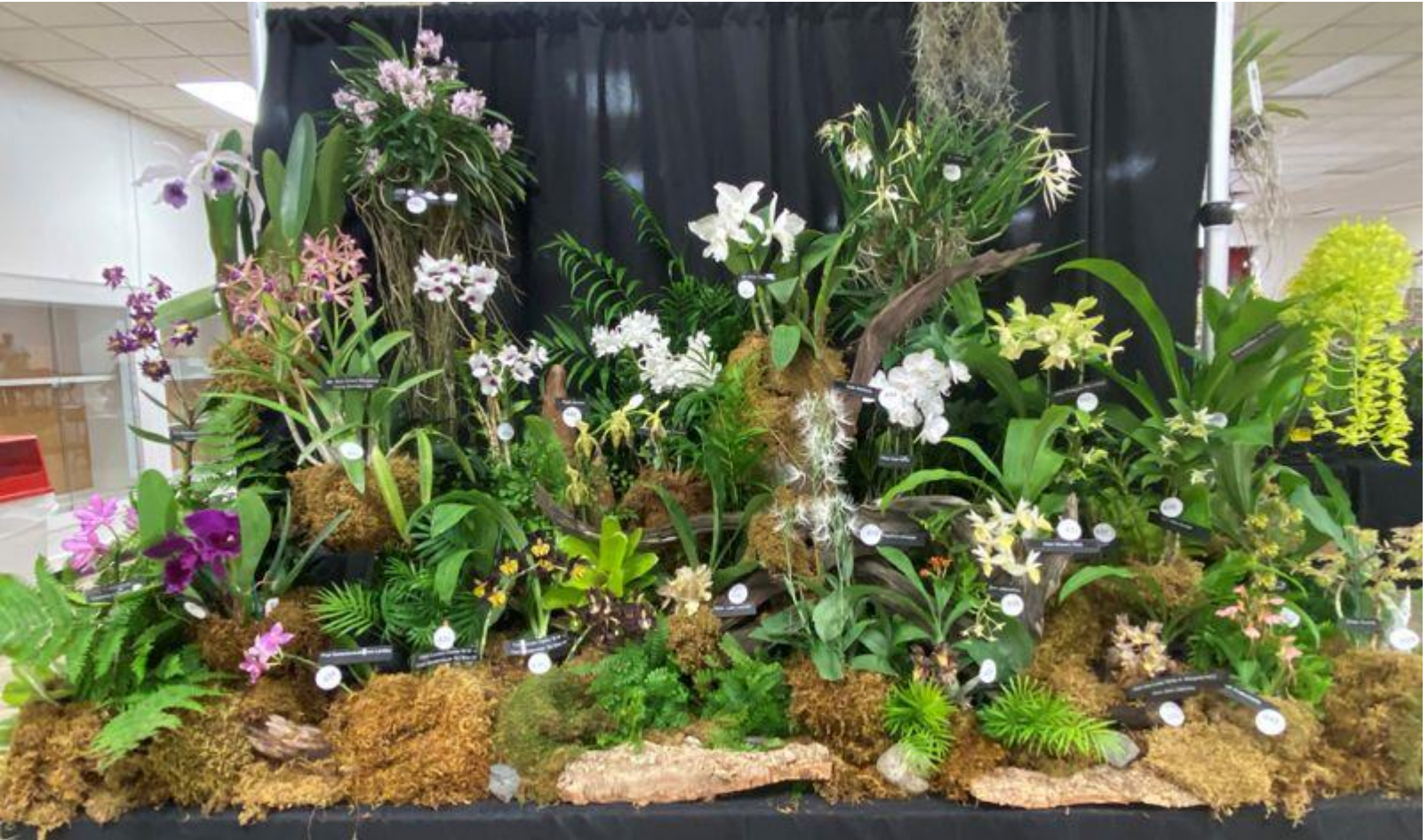
Show Trophy awarded to Accent Orchids for Best Exhibit in Show. Their display received 84 pts. and is described as follows: A well balanced and visually flowing 30 in. x 96 in. table top display, with a centrally placed delicate Habenaria medusa , and hybrid catasetum , among other well placed genera including Vandachostylis Lou Sneary 'Pink' , Paphiopedilum parishii , and Grammatophyllum scriptum . Strategically placed driftwood, cork, fern and rocks created a natural looking environment. Award #20201383.

Saturday, September 19, ribbon judging started promptly at 8:30 a.m. followed by AOS judging. Twenty-three plants were nominated for AOS review by eleven accredited judges, assisted by four student judges. Twelve of the nominations received quality awards. An AOS Show Trophy was awarded to a small commercial grower for the most outstanding display in the show. The society was excited! That is a record number of awards for their show.