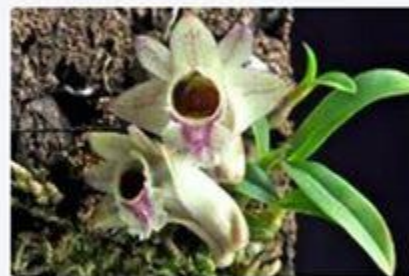
Dendrobium hekouense 'Cordelia'