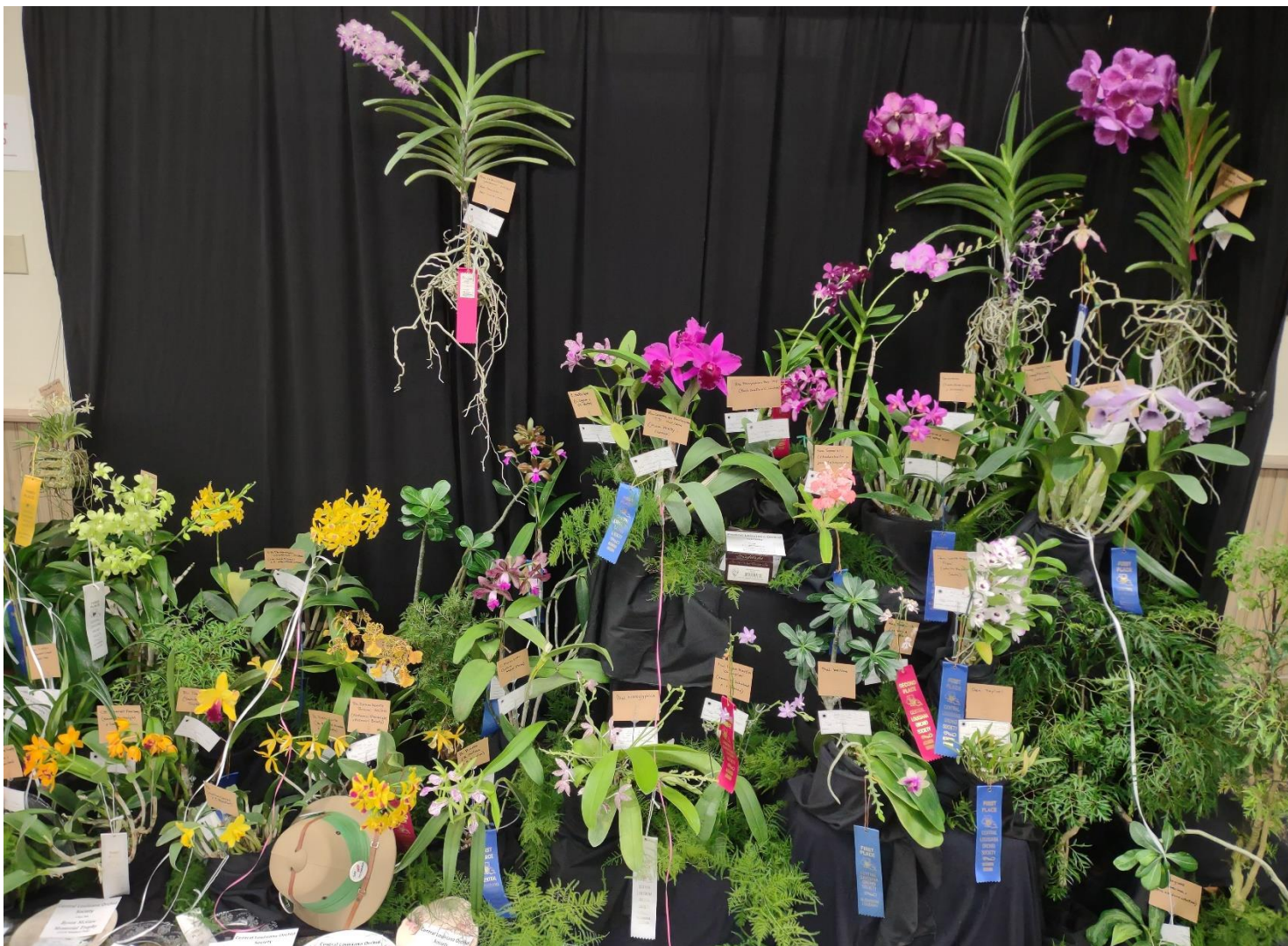
The award-winning Central Louisiana Orchid Society exhibit from the Fall 2023 CLOS Show!