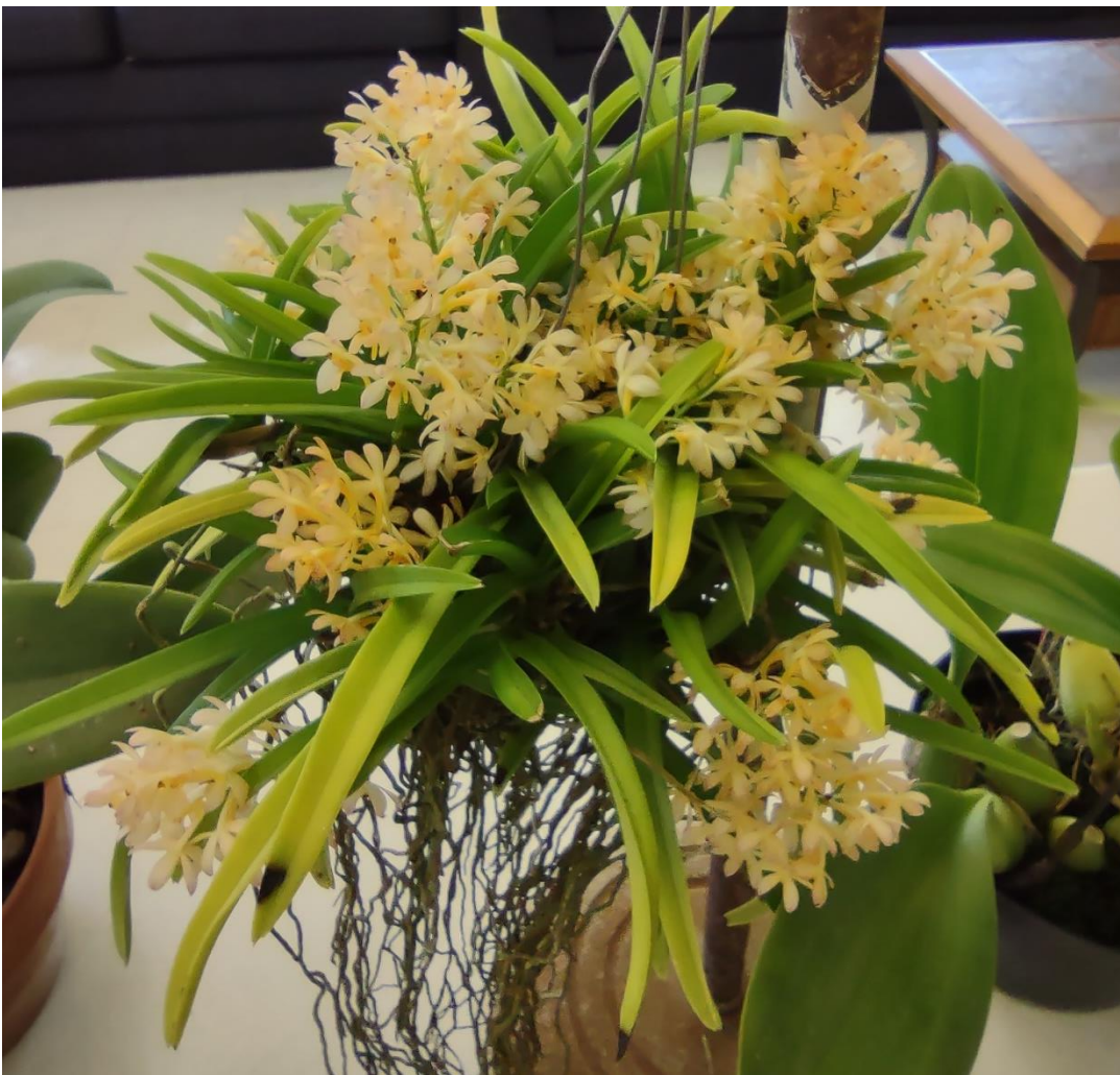
Al's Best Grown Plant – Rlla. Sugar Baby 'Louisiana' HCC/AOS – A gorgeous plant!

While most of the intermediate orchids struggle, many warmer-growing orchids take the heat in stride. Fertilize them well (weekly weakly at \frac{1}{4} strength of listed dose on the label) and allow them the chance to prosper in the summer heat. Pay attention to your Dendrobiums, Vandas, Catasetums, Brassavolas, and Encyclias, all of which use September for increasing their pseudobulbs.