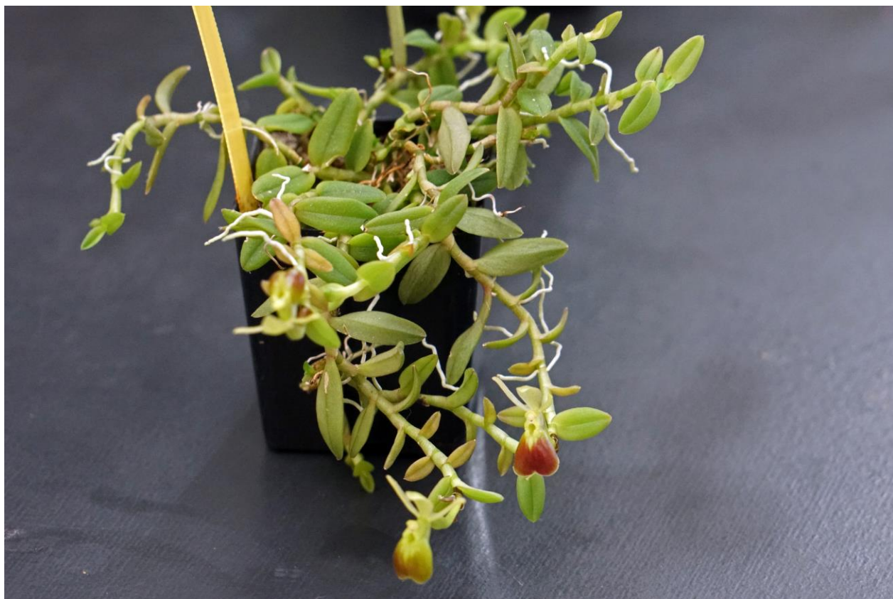
Unknown name-Jacob Dickson