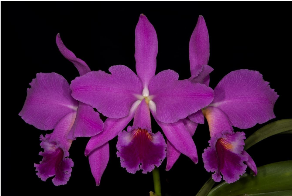
Cattleya jenmanii 'Terez' HCC | AOS (79 points)