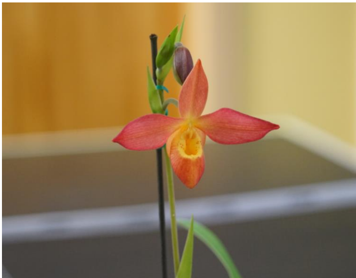
Phrag. Unamed-Eron Borne