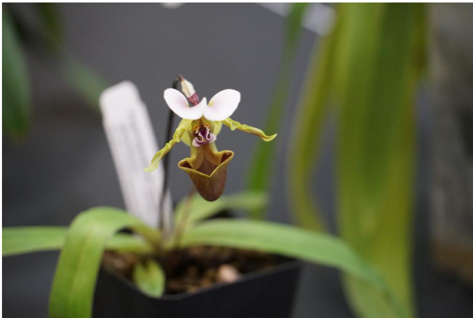
Paph spicerianum-Eron Borne