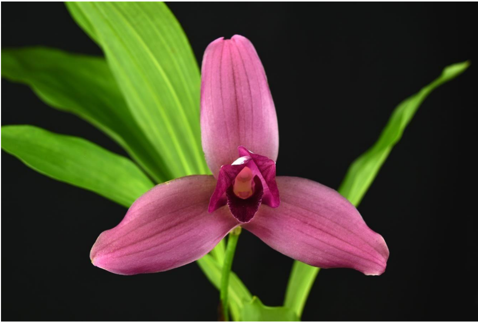
Lycaste Reina Del Cisne 'Nikole' AM | AOS (80 points)