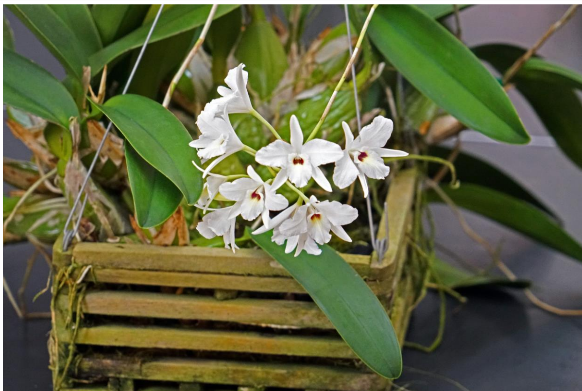
L rubescens-Eron Borne Best Grown Best Grown and tied for 2nd