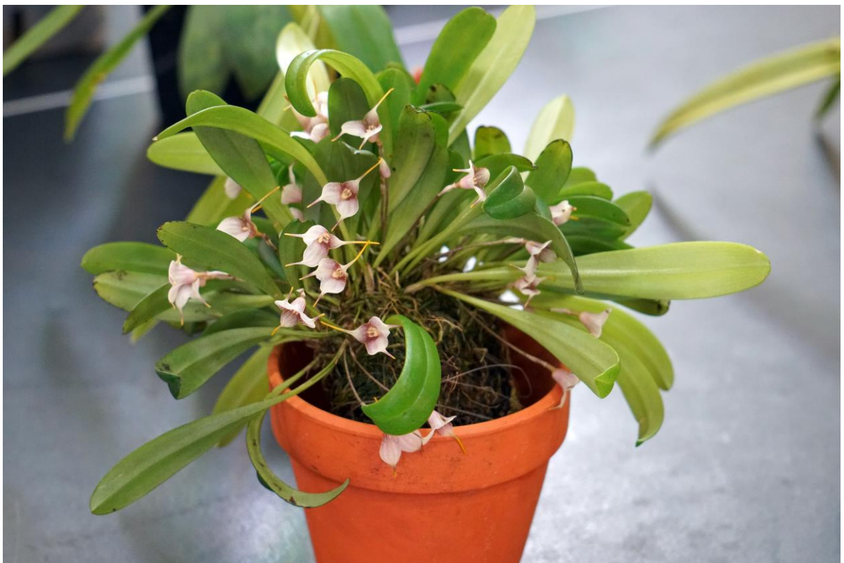
Masdevallia floribunda-Eron Borne