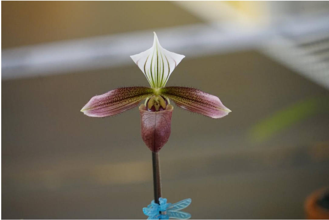
Paph purpuratum-Eron Borne