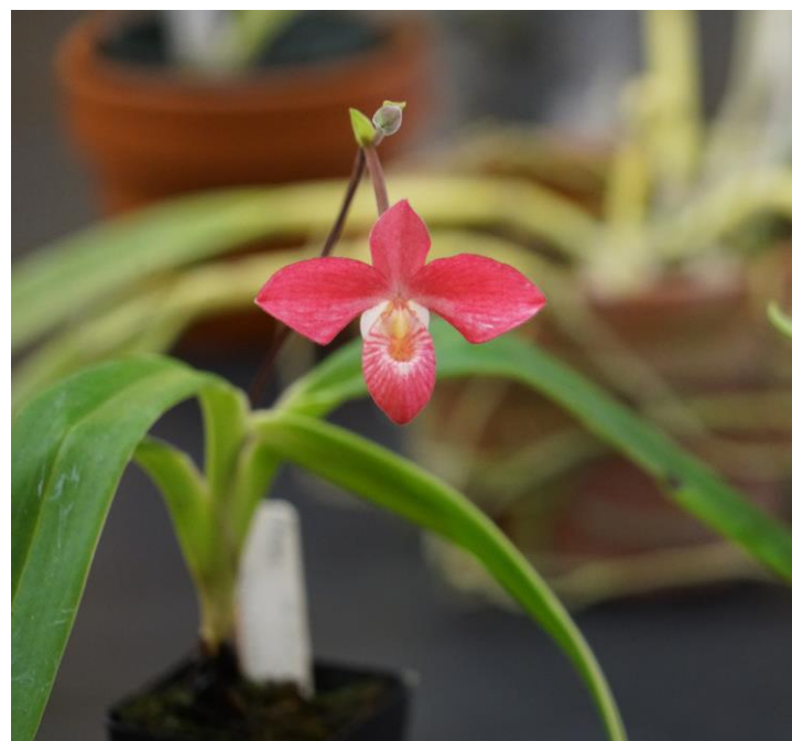
Phrag. Cahaba Susan Mattison 'Windy Hill'